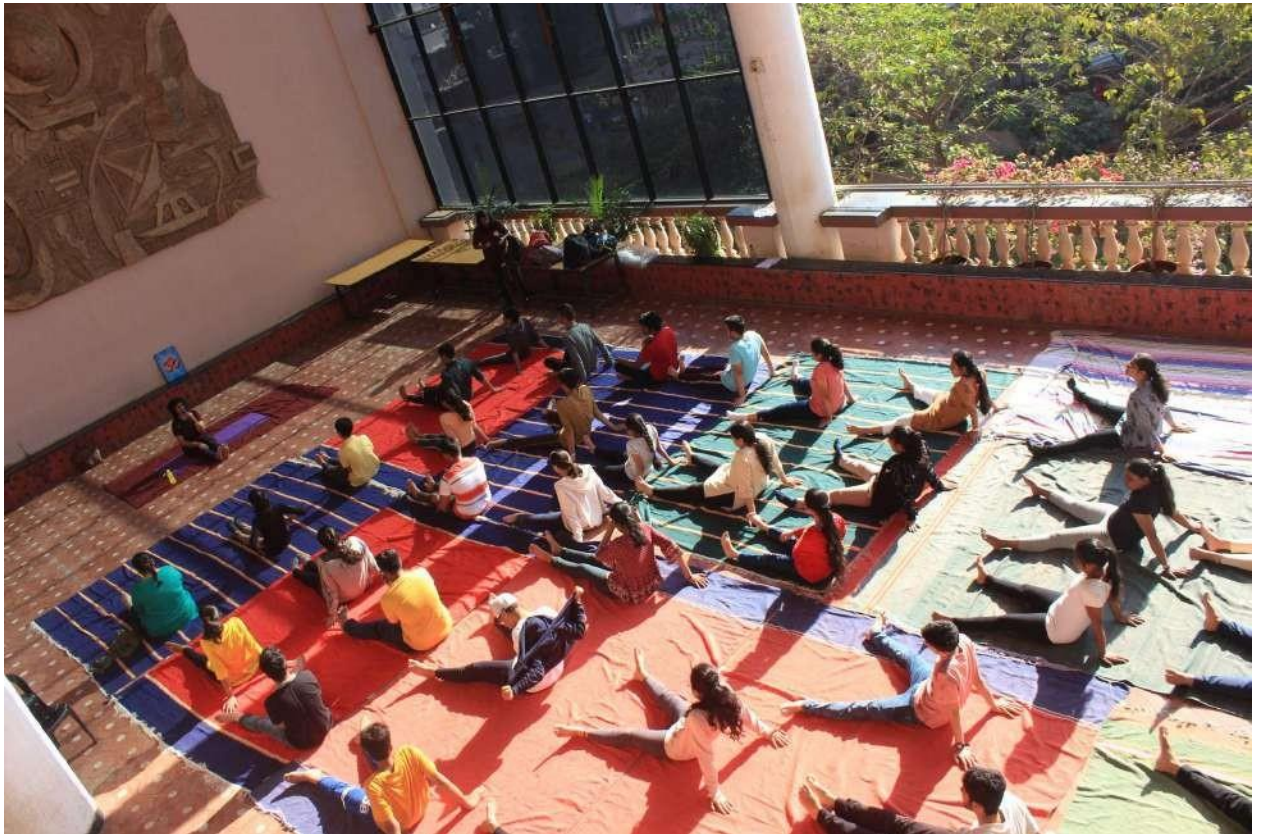
Yoga session (Amphitheater- Satellite End)