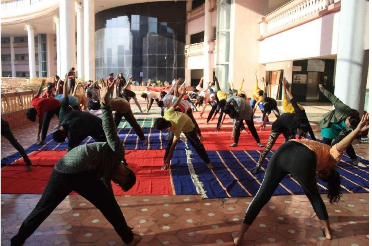
Yoga Session (Amphitheater- Satellite End)