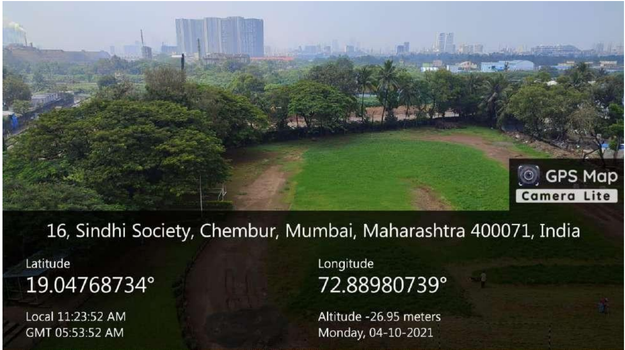
College Playground-2 (Geotagged)