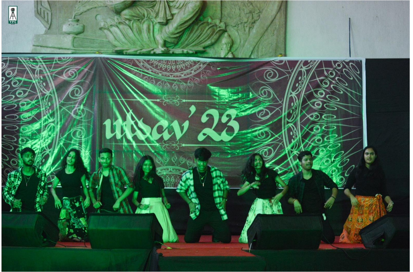
Utsav 2023 (Amphitheater- Saraswati End)