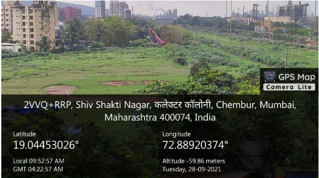
College Playground-1 (Geotagged)